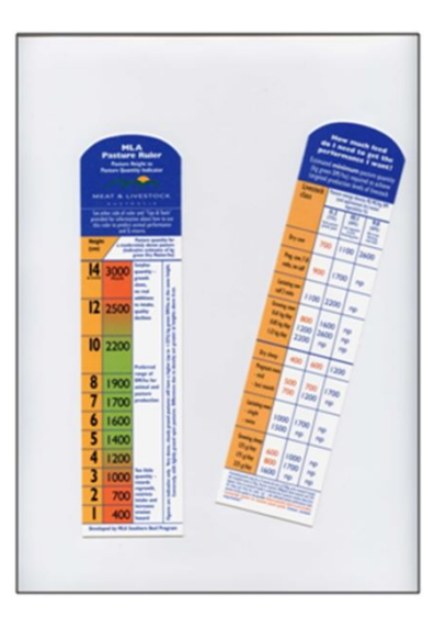
Figure 1: The MLA Pasture Ruler - order your copy here for free.

Note that both plate meters and electronic probes require calibration cuts for specific pasture types and compositions don't rely on the calibration data that comes with either.